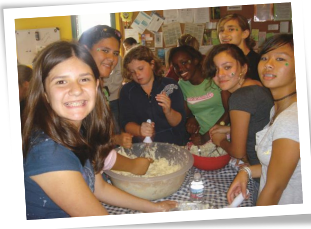
Cultural Kitchen is just one of the many programs offered by HI-USA