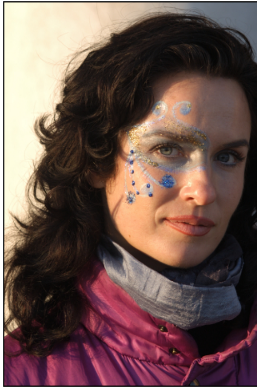
Carnival face painter, Venice, Italy