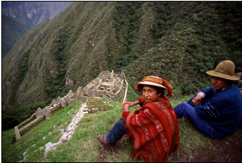
Along the Inca trail, Peru

was through this opportunity that he has had the chance to visit Central and South America, Asia and Europe.