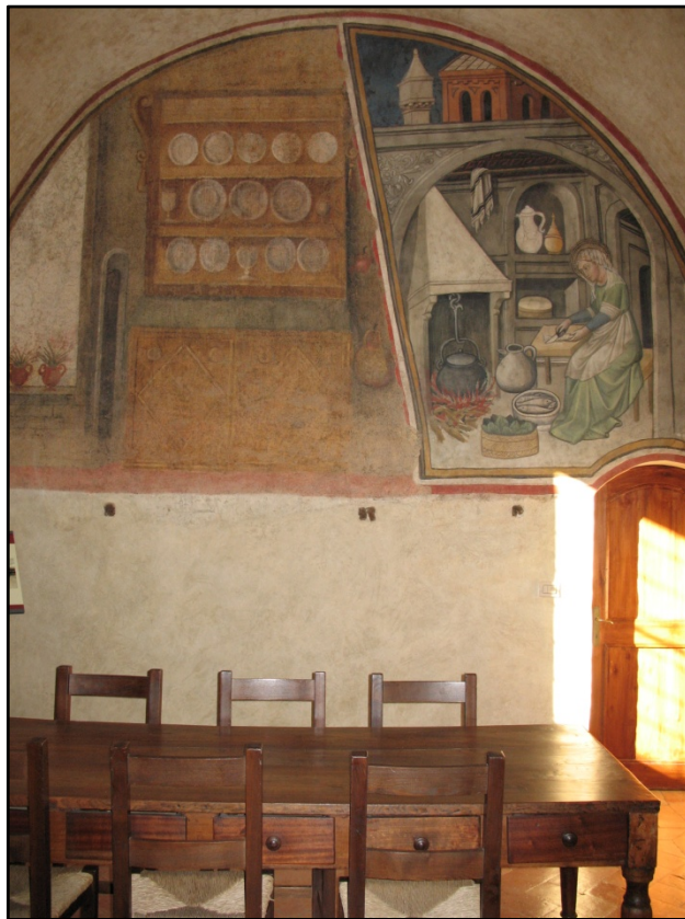
The dining room of the convent Casa Beata Angelina in Foligno, Italy. The fresco above depicts the head of the convent preparing a meal.