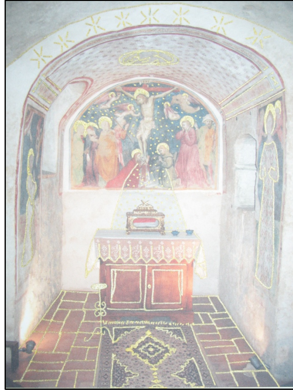
A mixed media piece I did. It is taken from a photo of the chapel in which Angelina prayed, at the Casa Beata Angelina in Foligno. This room has remained unchanged for 700 years.

While in Italy I visited convents and monasteries in metropolises like Rome, and tiny villages like Fossa Nova. I visited them in Emilia-Romagna, Toscana, Umbria, Lazio and Campania. Of all the things I recall most strongly, it is the pure, un-compromised humility that the suore and frati embody. The idea of humility —a virtue I have reflected on, admired, even tried to practice—is blown away by real humility —something that is so obviously present the air feels thick with it. Now I am back in my "normal" life in the U.S., a life characterized by material needs, busy rush, going from place to place. It is hard to believe that the lives I witnessed among the nuns and monks in Italy is real . That if one chose to, he or she could live a life radically different, not just in appearances but in the heart. I learned that the realities we inhabit are largely the result of our own desires and wills. I like living in the U.S., and I don't plan on becoming a nun, but I could still try to create a life as beautiful, visionary, humble, and imaginative as the nuns in Italy.