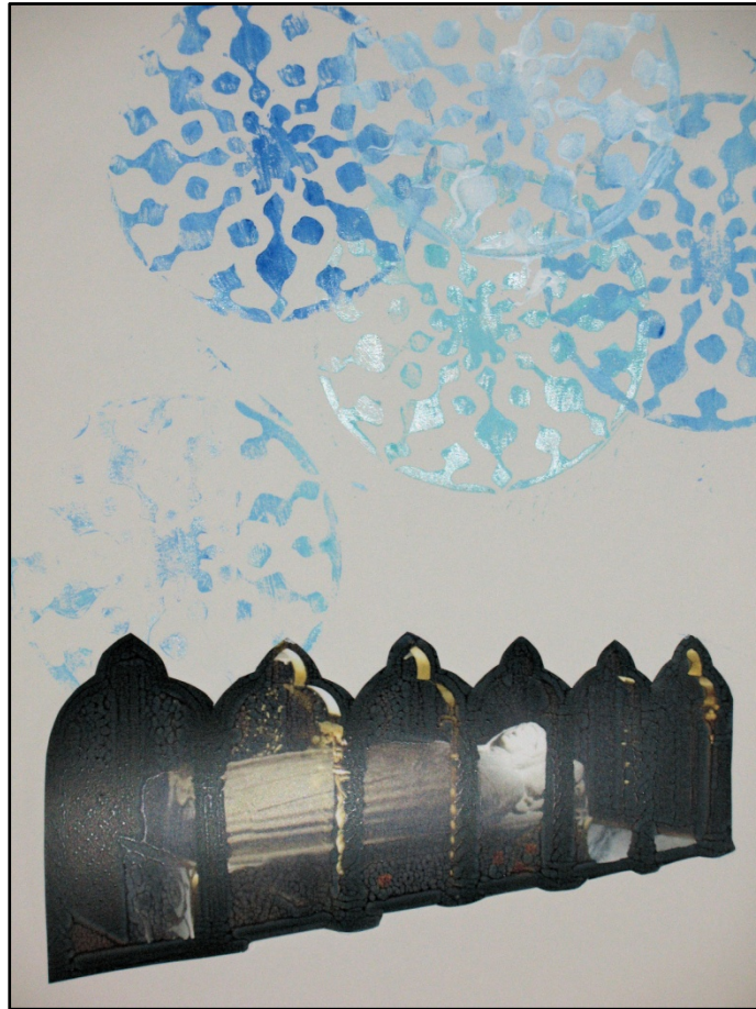
A mixed media piece of St. Catherine

lives confined to their convents. When I read the texts of these women, like Blessed Angela, or Saint Catherine of Siena, I found an incredibly expansive reality. The nun I encountered in the church of Santa Cecilia was confirmation of this.