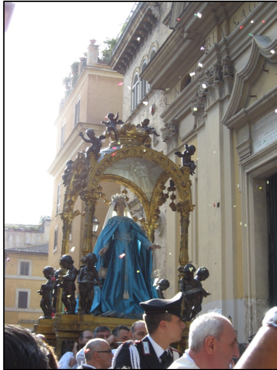
This is the Madonna being paraded around at the Festa de' Noantri in Rome. It illustrates how alive the festivals are in Italy.

surrounded by frescoes to be daily reminders, I wanted to make something domestic that could serve as a sort of "memory palace" for all of the people and places I saw.