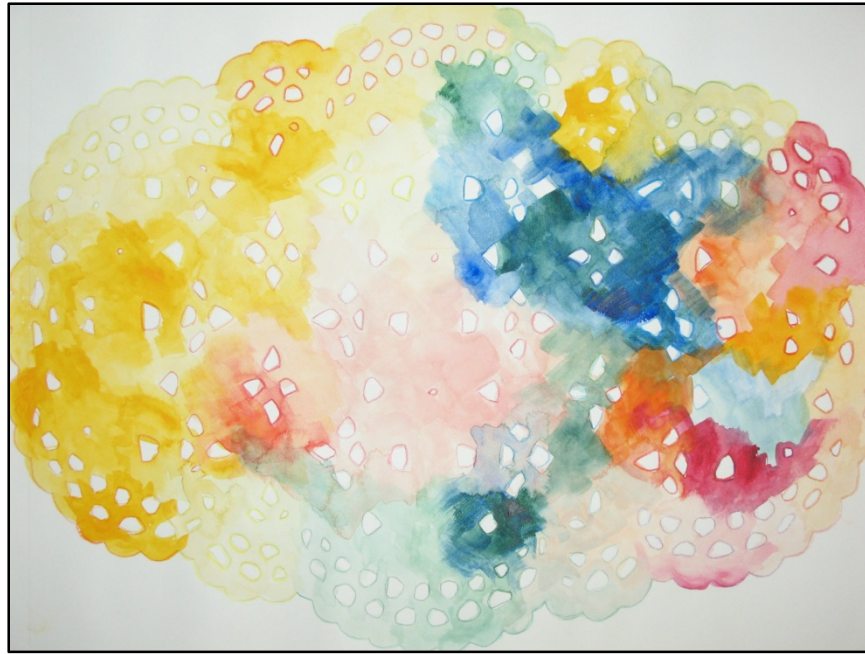
A watercolor of lacework.

On this particular day, as I was standing in the church with my pencil and notebook, an aging nun approached me, dressed all in white, with a purple knapsack and her rosary beads. " Lei fa il restauro? " she asked. ("Do you work on the restorations?") Startled, I told her no, I was just a student wandering through. "They are restoring the crucifix over there and I want to know when it will be finished. I can't see it now" she explained, only slightly disappointed that I couldn't help her. For the next hour, I stayed with her and listened as she shared accounts of miracles and mystical occurrences associated with the church. She came to Cecilia's church specifically for that crucifix, which was responsible for many miracles in her life. She told me of a dream she had that came true on the feast of Cecilia. She told me of her depressed nephew who was "cured" when he prayed at this crucifix. She told me the story of Santa Cecilia herself, and how after she was beheaded, her head still hung onto her body for three days. Cecilia's ghost, by the way, still lived in the church. " Tanti miracoli in questa chiesa! "