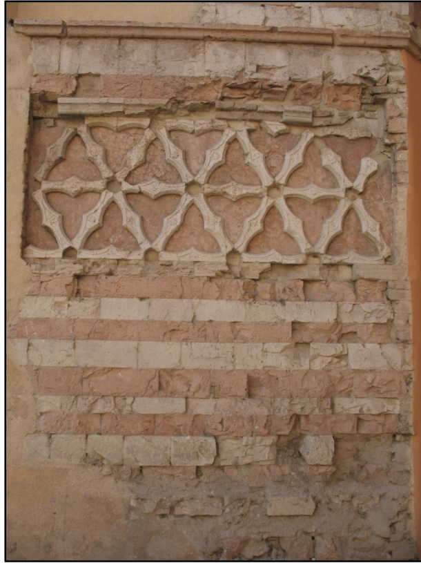
Rose colored stones in Foligno.

The absolute highlight of my time in Italy was my visit to Foligno, a small town in Umbria. It was the home of Blessed Angela, a 14 th century Franciscan mystic who inspired me to go on this journey. The whole city is rose colored—as if Foligno had been carved from one piece of stone. While I cannot say for sure, it seemed that that little town had more churches per capita than anywhere I've been. Each church was rose colored, but each had a distinct facade or tower. I visited Angela's birth home; I visited Angela's tomb. Her body is encased in glass in a now abandoned convent. Luckily I was the only visitor to that church, and a delighted if slightly baffled janitor ("You actually know her? You came from America to see her?") gave me a tour of the place (which he insisted against my "aaaaah" and " che bella " was nothing special.)