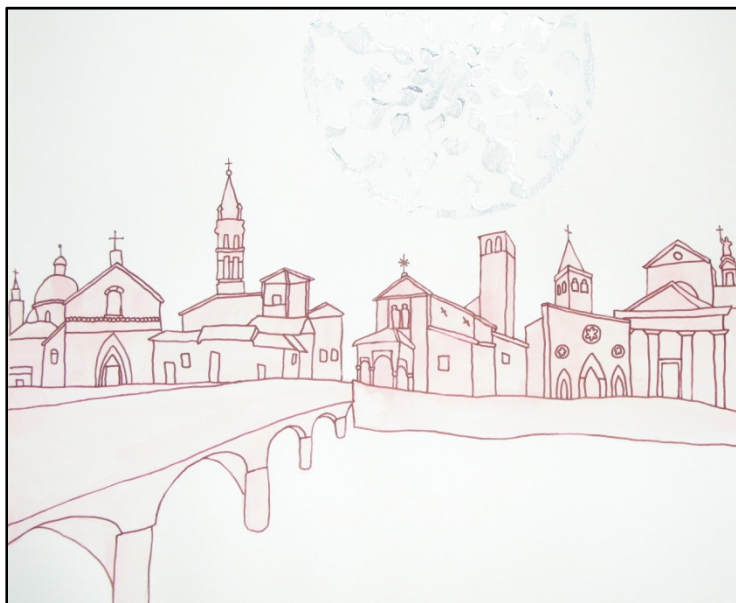
A sketch of "Foligno's churches."