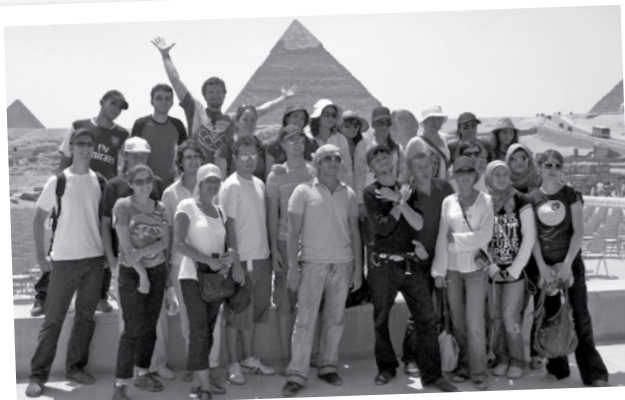
Your gift furthers HI-USA's mission.

How it works: Up to $100,000 could be directed to charity, and the